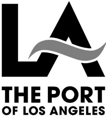
The Port of Los Angeles

The Southern California Academy of Sciences wishes to acknowledge the following organizations and people for their support of the 2009 Annual Meeting.