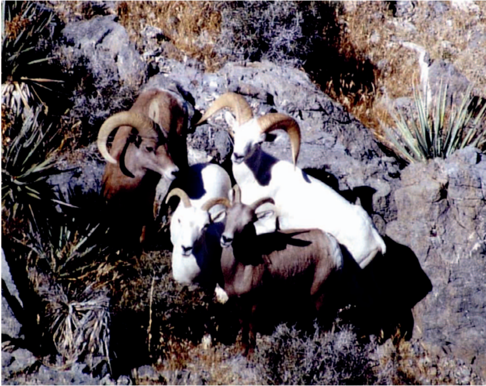
Fig. 1. Leucistic female and normal female bighorn sheep and leucistic male and normal male bighorn sheep in the Clark Mountain Range, San Bernardino County, California, 25 September 1998.

In western North America, bighorn sheep occupy suitable habitat in two Canadian provinces, 5 states in Mexico, and 15 of the contiguous United States. I carefully reviewed information from throughout the range of that species, including descriptions obtained from the literature or from electronic references, and the photographs, electronic images, or detailed descriptions provided by respondents. When information or the quality of an image was sufficiently detailed, I determined if individuals described either as ‘white’ or ‘albino’ were leucistic or albinistic. In addition, I reviewed the results of waterhole counts, aerial surveys, and other aerial events conducted from 1976 to 2009 by personnel from the California Department of Fish and Game (CDFG) or Bureau of Land Management (BLM) in the Nopah Range, Inyo County, California and the Kingston, Mesquite, and Clark Mountain ranges, San Bernardino County, California—areas from which leucistic bighorn sheep previously had been reported. I also reviewed results of aerial surveys of the Avawatz Mountains, San Bernardino County, an area of interest because the Southern Piute word avawatz implies “white sheep” (Werner 1951).