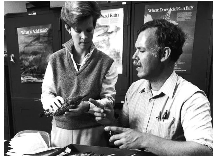
Cover: Dan Guthrie photo with permission of Claremont McKenna College.