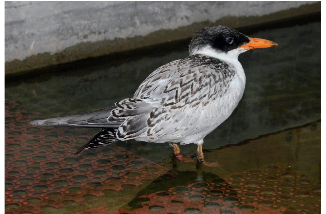
Cover: Caspian Tern, Hydroprogne caspia , photo with permission of International Bird Rescue.